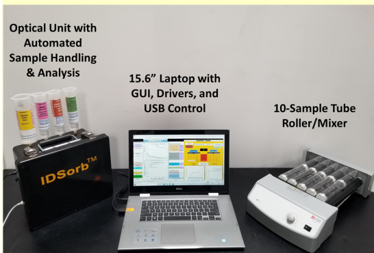
Optical Unit with Automated Sample Handling & Analysis